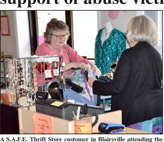
Photo by Jarrett Whitener recent 20/20 sale. By Jarrett Whitener Towns and Union county